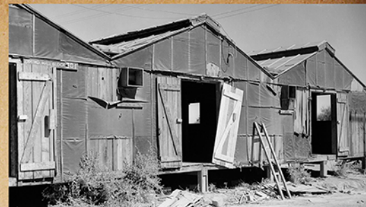
The deserted buildings of the Colorado River War Relocation Center were already falling to pieces within months of abandonment. These barracks illustrate the cheap materials, rough lumber and tar-paper used in their construction - May, 1945.

A year after initial internment, the War Relocation Authority created a loyalty review program. Approximately 31,000 internees determined to be loyal were allowed to leave internment sites to attend school or work, but were not allowed to return to the West Coast. The War Department eventually terminated the exclusion and internment orders on December 17, 1944. Internees were given a train ticket and $25 to resettle. There were no programs to help Japanese Americans reintegrate into normal American life. By the end of March, 1946, all of the War Relocation Centers were closed. Many who returned to their homes found that their property had been stolen or vandalized. A large number never returned to their homes, but instead resettled in places in the Midwest and East. Some faced strong public sentiment against Japanese Americans.