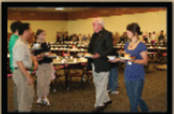
The Japanese American members of the Dry Creek PTA started frying shrimp at the school carnival in 1962. This fund-raising activity evolved into the annual Japanese American Citizens League shrimp dinner held at the Clovis Veterans Memorial Building on the first weekend of February. Beginning with one scholarship, the Clovis JAACL now awards scholarships to each of the high schools in the Clovis Unified School District and donates to numerous other community organizations.