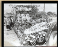
The Clovis Day Parades and the Rodeo have been a significant part of Clovis. Veterans have always been an important part of the festivities. Fumio "Ike" Ikada was proud to march with his fellow veterans during the parade. The Clovis Community Church won a variety of parade categories with floats, covered wagons, and horse drawn surreys. The community met at Yoshiko Takahashi's shed the Friday night before the parade to collect, cut, and decorate the entries with flowers. Participation in the parade helped a return to normalcy after WWII.