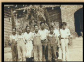
The Issei realized the importance of education, so schools were the key to improving the lives of Japanese Americans. Garfield Elementary School had a profound impact on the education and socialization of the young Nisei, second generation Japanese Americans, and their friends.

During the Depression the Issei pooled their money and purchased land on Villa Avenue just north of Sierra Avenue. Soon after, they moved a wooden building onto their property and named it the Clovis Community Church. "The Hall" was used for meetings, holiday gatherings and language school. It later became the Clovis Buddhist Church. Today, the northern portion of the property is home to the United Japanese Christian Church.